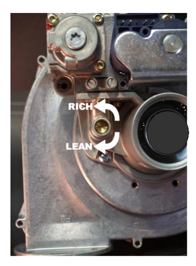
Illustration 2 - Air/Gas Mixture Ratio Screw

Combustion Field Adjustment Instructions