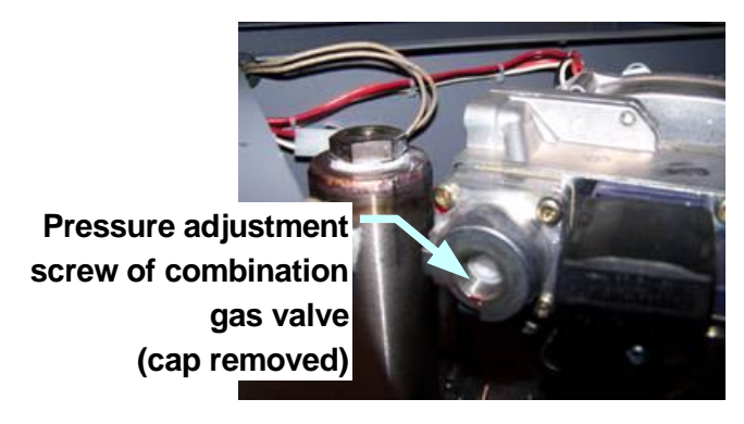
Illustration 3 - Gas Valve Adjustment Screw